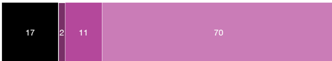
Figure 3:3 shows the proportion of homes bought with financial assistance from family or friends between 2005 - 2012 (2013 has been excluded as it is an incomplete year). It shows that levels of financial assistance have tended to increase since 2005.

Base: All first-time home purchases since 2005 (n=1,076) ■ % Gift only ■ % Both ■ % Loan only ■ % Neither